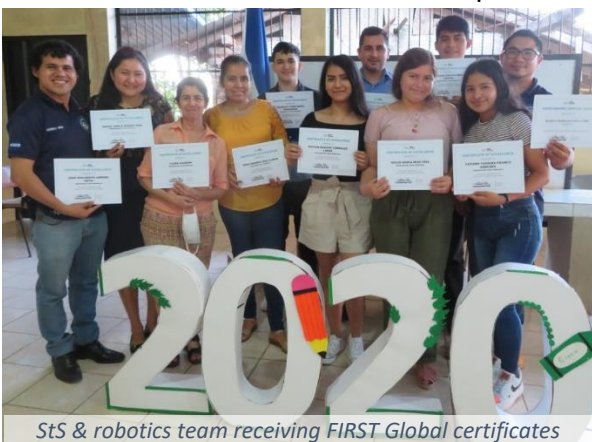
StS & robotics team receiving FIRST Global certificates

For the Lego robotics program this last quarter had few activities, as students turned their focus to completing the school year. With the pandemic still present next year, we plan to find ways to further engage our Lego teams and promote their learning while staying safe in their communities. We hope to share more of these plans in the future.